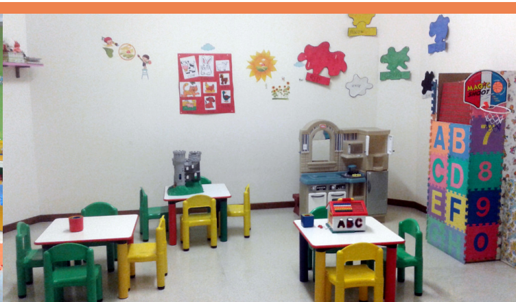
The workshop room